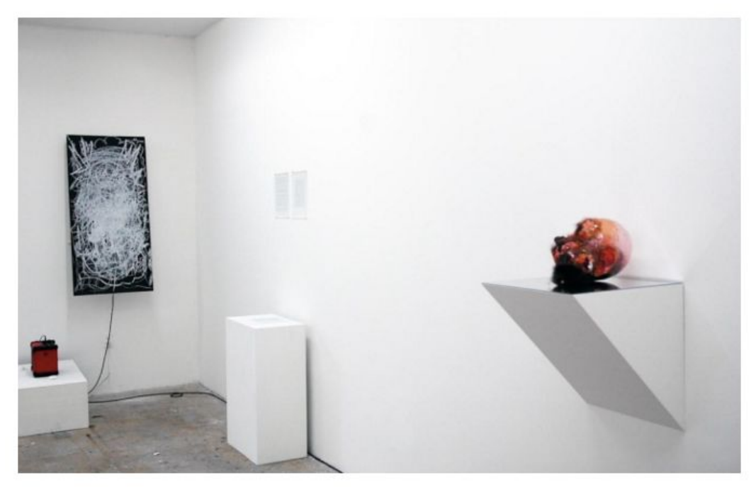
Pussy Don't Fail Me Now at Cindy Rucker Gallery

On the ninth of July, we visited the Lower East Side and attended the opening reception at the Cindy Rucker Gallery on 141 Attorney Street, which presented a group exhibition called PUSSY DON'T FAIL ME NOW. The work of the three female