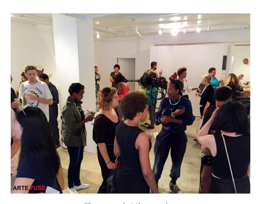
The crowed at the opening