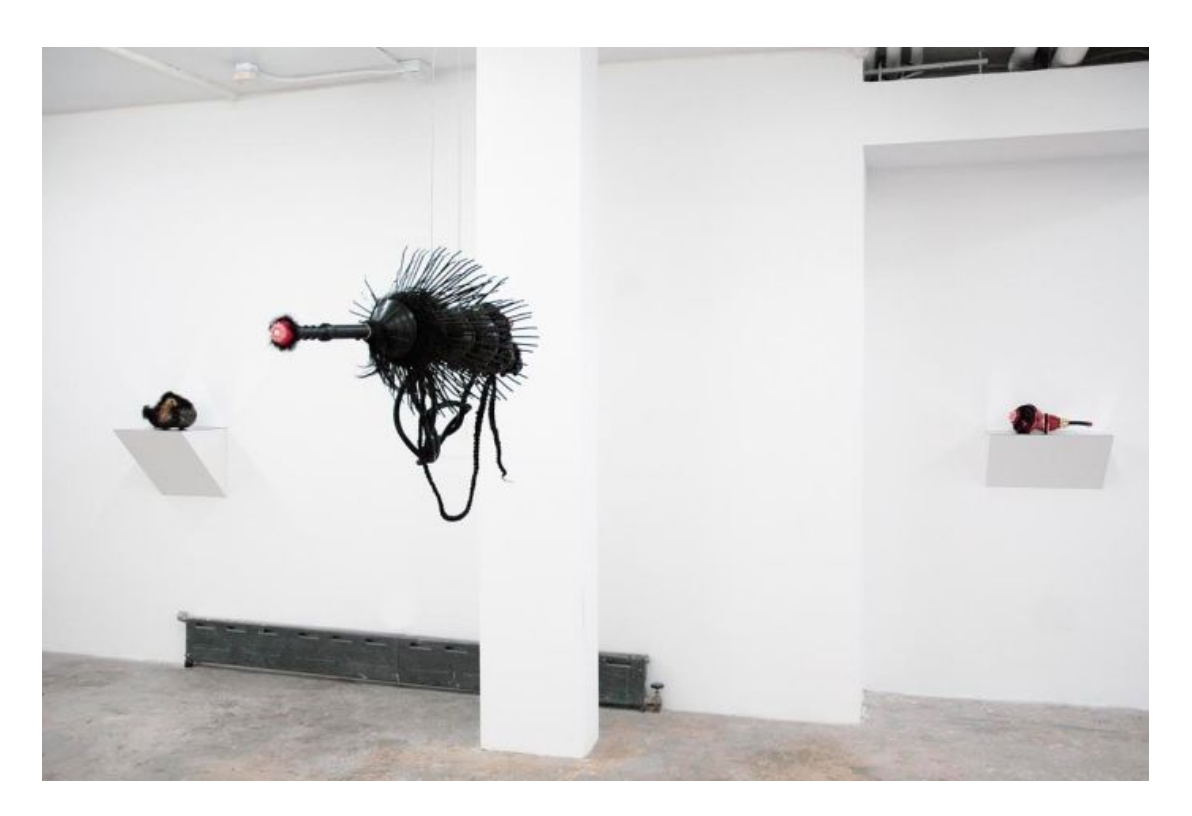
Installation shot of Pussy Don't Fail Me Now at Cindy Rucker Gallery