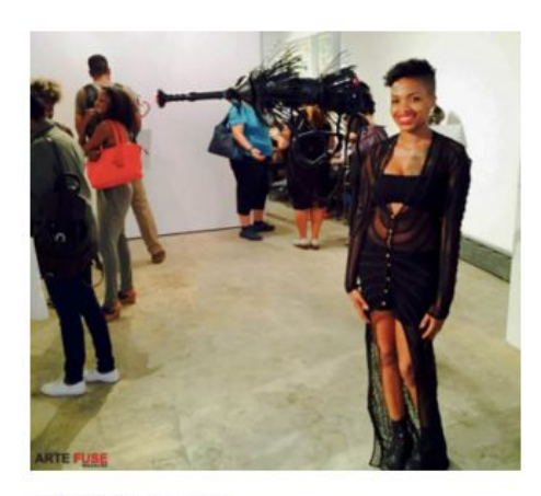
Artist Doreen Garner

model of a businessman holding a briefcase, acts as a "reminder that privilege is illusory and is available for those willing to accept it." It also invites the audience to "take them [the chalk] as their own symbols of white male power..."