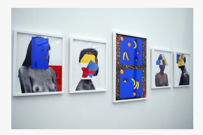
Esteban Schimpf for Present Co.