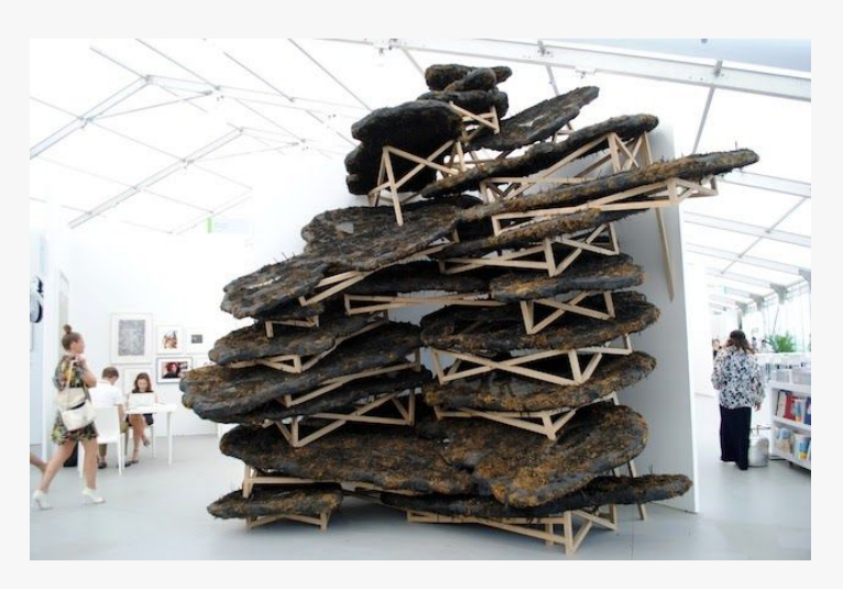
Blane De St. Croix at SiTE:LAB