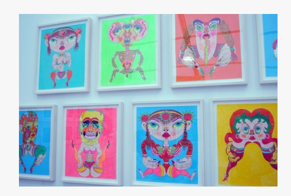
Keiichi Tanaami for Little Big Man Gallery