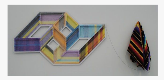
Adrian Esparza at Cindy Rucker Gallery

With its many large-scale works, often composed of resourcefully repurposed media, UNTITLED is filled with spectacle. If you're in Miami Beach this week, the fair is on view through December 7. Otherwise, take a look at some photo highlights from UNTITLED below and stay tuned for more Miami Art Week coverage.